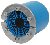
RS yalıtım malzemesi